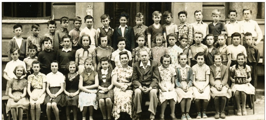
Fifty years ago: Sixth grade - the top row, 3rd from the right.