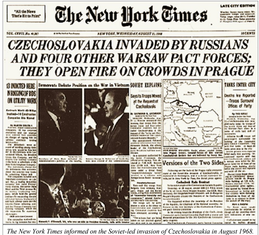
The New York Times informed on the Soviet-led invasion of Czechoslovakia in August 1968.