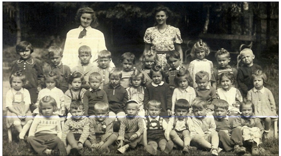
Sixty years ago: Kindergarten 1951 - the top row, the first on the right with a fresh haircut.

A: Up until my high-school years, I was a promising violin and French horn student. At the age of fifteen, I even won an annual competition for young players conducted by the International Radio and TV Organization. For the first time, I saw my name in the media. My parents were excited. It was clear I would pursue my post-secondary edu-