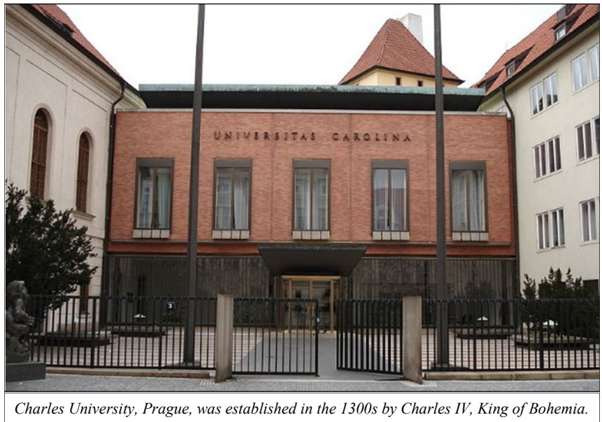
Charles University, Prague, was established in the 1300s by Charles IV, King of Bohemia.

A: I wish it were that easy! The starting salary of an assistant professor was shockingly low. The university was located in Prague, known for its permanent accommodation crisis. After graduation, I was obliged to serve 12 months of compulsory military service. Would this job wait for me? Ultimately, due to the lining up of stars and family sacrifices, I was able to enter the halls of the ancient university as its employee. The Bohemian part of my academic career could start.