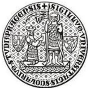
The original seal of Charles University